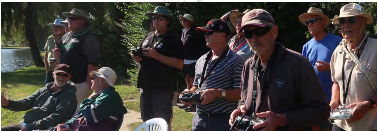
Tense start to fleet racing