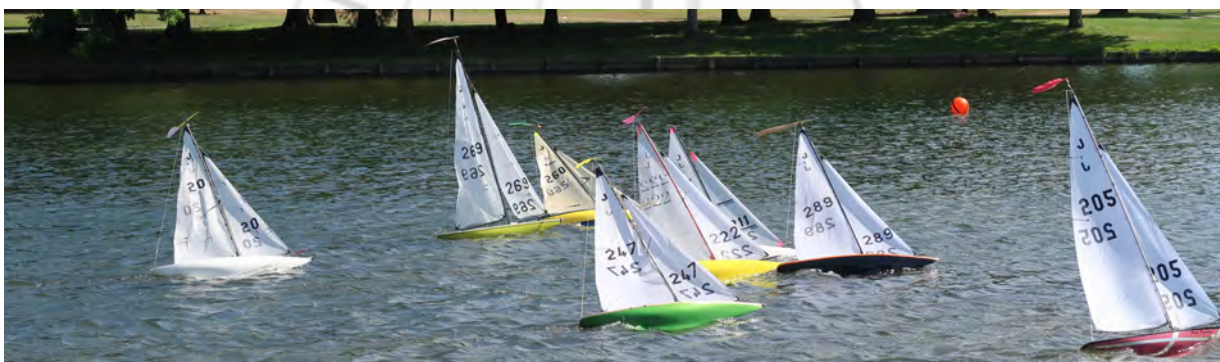
The race is on