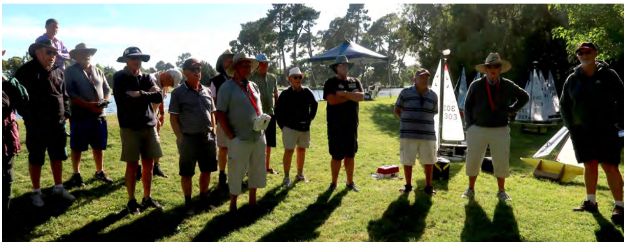
Race Officer Briefing