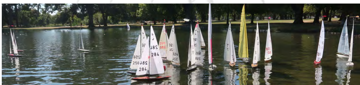
A complex mark rounding