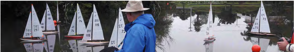
Sailing on the Tauranga Lake.