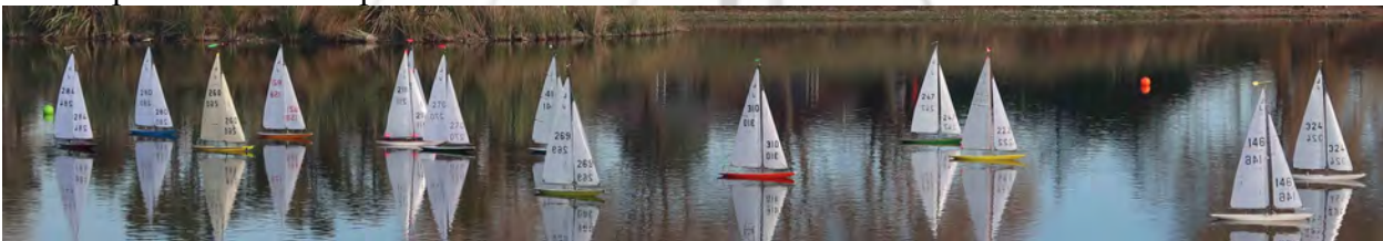
Sailing on Westlake.

This event was Introduced in 2019 after gaining approval to sail at Westlake reserve lake. We are careful not to disturb the wildlife on and around the lake. There are line honours and handicap winners and trophies.