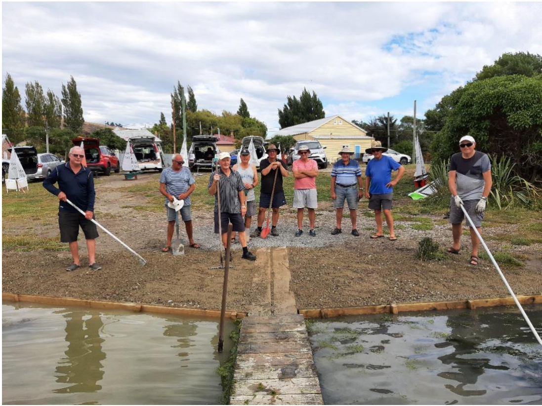
Fishing for J Class at Lake Ferrymead