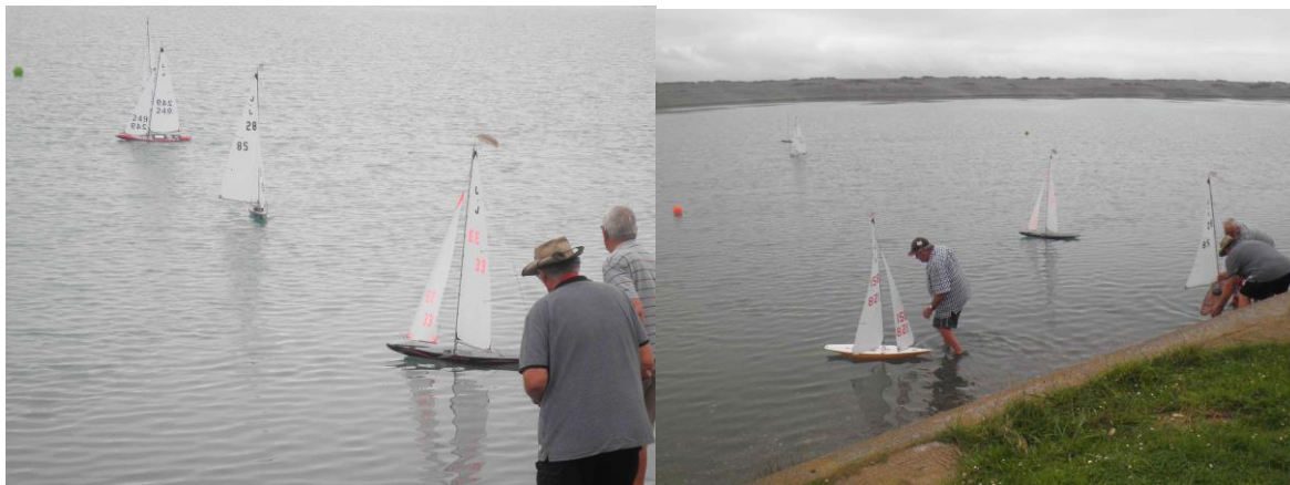
Rakaia Lagoon CJOA fun sailing day