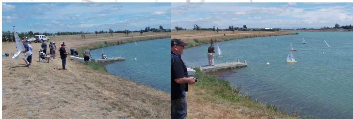
Lake Hood CJOA big lake and relaxed sailing day

We finished racing about 3.30 and adjourned to the Lakeside Restaurant with about 15 of us for drinks and nibbles so all in all a great day and we would like to make it an annual event. Cheers Wes”