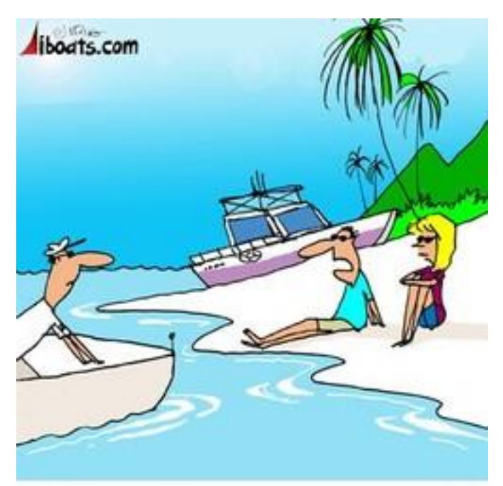
"Our boat is fine, and we're not stranded. We just don't want to go back to that crazy world."