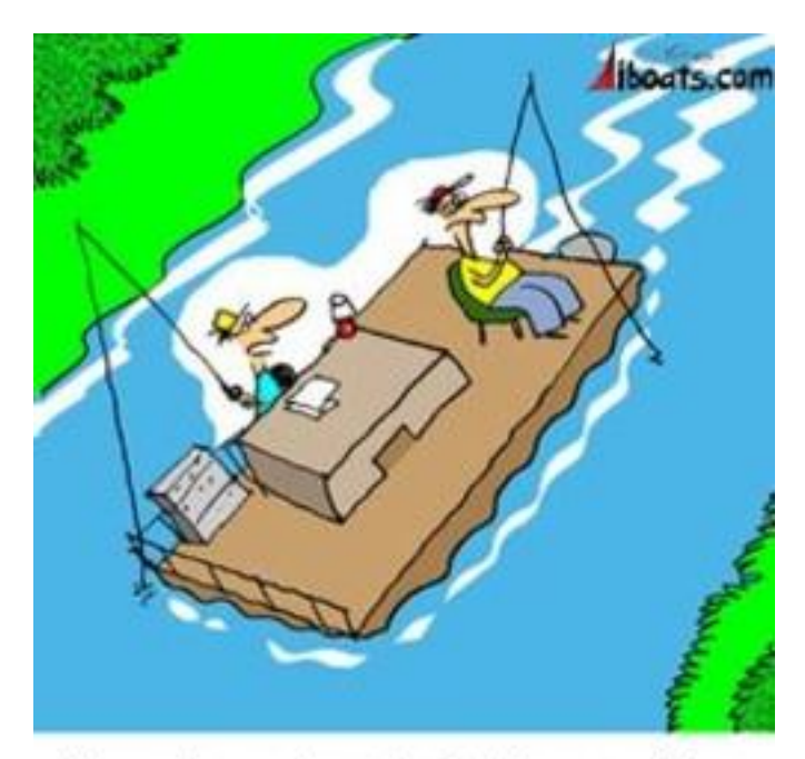
"I made my boat look like my office. That way I don't feel so guilty when I call off to go fishing."